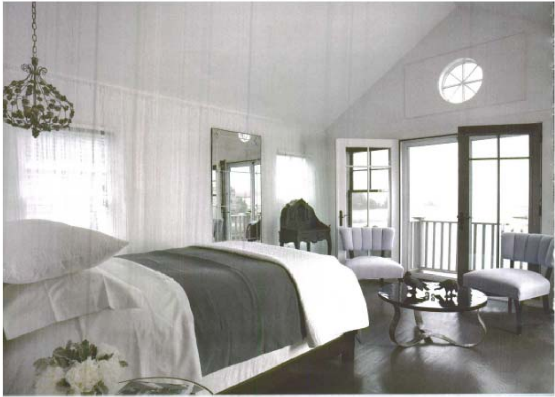
Room With a View | The Mitchell Gold+Bob Williams chairs and Oly Studio table offer a place to sit and take in the view, while a large mirror reflects the light from the water. A custom-made Robert Allen headboard complements the bedding by Frette. See Resources