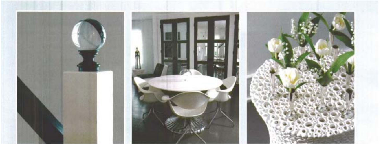
Crystal Ball | The staircase (Inial Gove 1217) was made with a solid glass ball from the end of the curtain rod. It's My Secret | Custom-made exterior-grade doors by TruStile (above concrete) conceal storage closets. The white table from Oly Studio and chairs from Design Within Reach create a dining area. White On White | Tiny bud vases with a single bloom from Botanica Floral Design (above floor) adorn an Oly Studio side table. Designs For Living | A stately clock from Elech van Breems presides over the "formal" living area (below) defined by four Mitchell Gold-Bob Williams chairs covered in fabric from Designer's Guild. The mannequin sculpture is from Lillian August. An ever-flowing antique urn and the floor lamp from Anthropologie continue the glass ball theme, while a photograph by Tre Cassetta complements the color scheme. See Resources.