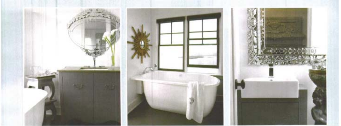
The Silvery Light | An antique mirror (above left) from Petisi's extensive collection reflects light from the pond into the master bath. She silver-leafed two small stacking tables that hold bathroom accessories. The West Mount custom cabinet also has a marble countertop from Casatelli. Water World | A long soak in this Victoria & Albert tub from Klaff's (above center), combined with the expansive view of Sherwood Mill Pond, is the ultimate in relaxation. Mirror, Mirror | A large antique mirror (above right) dominates the downstairs powder room, making it appear more expansive. A substantial sink from Klaff's sits atop the West Mount cabinet. The White Room | Diffused light and an all-white décor (below) create a dreamy atmosphere in the second-floor salon. A Mitchell Gold+Bob Williams couch makes for comfortable lounging. A dresser is called into service as the media cabinet and a silver candelabra, Petisi's silver-leafed canvas and a chandelier from IKEA add formal touches to the room. See Resources.