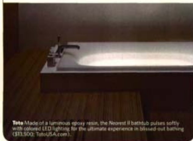
Toto Made of a lustrous epoxy resin, the Neorest II bathtub pulses softly with colored LED lighting for the ultimate experience in blissed-out bathing ($13,500; TotoUSA.com).

Hot Tubs As bathrooms turn into spaces for living and relaxing, stand-alone tubs have become the focal point. These statement pieces come in a range of materials, from exotic marble to resplendent glass. Oversize and spacious, the vessels put less emphasis on high-tech jets and massage options and more on blissful soaking to bring calm to busy lives.