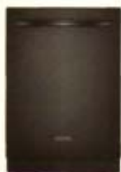
KitchenAid Wonderfully quiet during its cleaning cycle, the black steel Superba series EQ dishwasher is half as loud as an average conversation ($1,400; KitchenAid.com ).

Dark Stars Giving a nod to high fashion, kitchen and bath products are dressed in black to dramatic effect. This stylish shade is now available in a range of materials and textures, including rich marble, shiny porcelain, sleek glass and embossed quartz. Finishes range from matte powder-coating to polished and plated nickel and chrome.