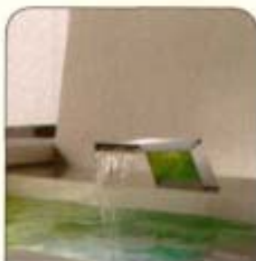
Dornbracht The Supernova bath spout, with its complex angles and cascading water stream, looks like a piece of sculpture (polished chrome, $2,700; Dornbracht.com).