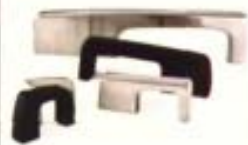
Du Verre These hefty Rise pulls are die-cast from 95 percent postconsumer, recycled aluminum and have a matte black powder-coated finish ($14 to $95 each; DuVerre.com ).