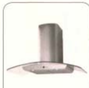
Viking its 36-inch Designer Series chimney wall hood, in stainless steel with luminous 8mm-thick glass, is virtually seamless, with no visible screws ($1,800; VikingRange.com).