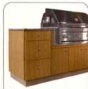
Atlantis Want a kitchen in your backyard? This company's new bamboo outdoor cabinets will help you rack up LEED points (from $3,000; OutdoorKitchensByAtlantis.com).