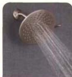
Moen Envi Eco-Performance Rainshower saves water but doesn't compromise on luxury—the head expands to 100 nozzles for an about-drench (brushed nickel, $300; Moen.com).