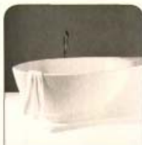
Burgbad Made from mineral-cast and natural stone, the Pi bathing pool offers a unique rounded shape for dipping and soaking (75" l x 40" w x 21" d, $12,125; Burgbad.com).