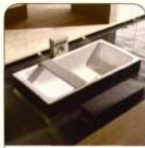
Kaldewei Nearly 80 inches long and 40 inches wide, the Bassino steel enamel tub allows a bather to float freely and experience almost complete weightlessness ($6,420; Kaldewei.com).