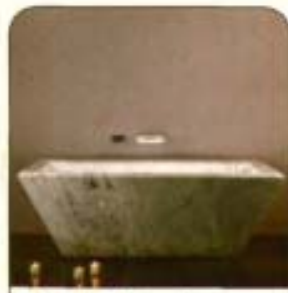
Stone Forest Carved from a single block of Carrara marble, the Ruba bathtub is a stand-alone piece of art weighing 2,800 pounds (68" l x 40" w x 24" h, $23,500; StoneForest.com).