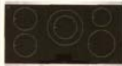
Bosch Its 36-inch induction cooktop features AutoChef, a sensor that calibrates the exact amount of energy needed for consistent cooking heat ($3,300; BoschAppliances.com ).