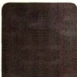
CaesarStone The sand-blasted surface of Motivo Crocodile quartz looks like an embossed-leather handbag ($100 to $150/sq. ft. install; CaesarStoneUS.com ).