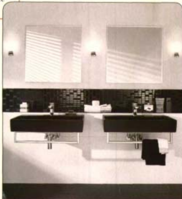
Villeroy & Boch A strong architectural statement, the angular Merano sink from this high-end European manufacturer now comes in cool, glossy black (31½" w x 18½" d, $1,130; Villeroy-Boch.com/en ).

Dark Stars Giving a nod to high fashion, kitchen and bath products are dressed in black to dramatic effect. This stylish shade is now available in a range of materials and textures, including rich marble, shiny porcelain, sleek glass and embossed quartz. Finishes range from matte powder-coating to polished and plated nickel and chrome.