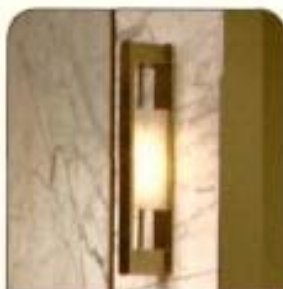
Rocky Mountain Hardware The glamorous Mod sconce has a sustainable edge—it's made from recycled bronze and has an LED option ($1,725; RockyMountainHardware.com).