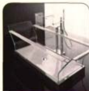
Novellini The stylish Cristal bathtub is good for the planet—it's made of recyclable aluminum, zero-impact-emissions glass and ABS plastic (78" l x 30" w, $14,200; Novellini.com).