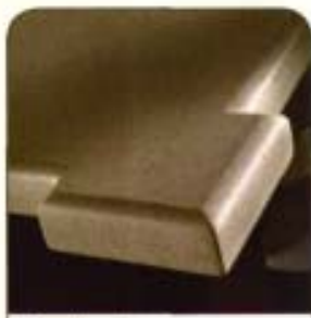
Cosentino The Eco countertop is made of 75 percent post-consumer, recycled raw material and is bonded with a urea-based resin ($68 to $118/sq. ft.; EcoByCosentino.com).