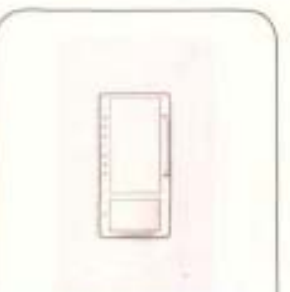
Lutron A leader in light control, its energy-saving Maestro dimmer with occupancy sensor detects fine motions and turns the lights off when the room is empty ($55; Lutron.com).