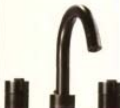
Samuel Heath Its masculine Xenos Black solid-brass three-hole basin mixer is meticulously hand polished and plated in up to 34 individual processes ($1,715; Samuel-Heath.com ).