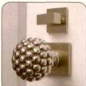
Sherie Wagner Interior star Vicente Wolf lends his hand to a collection of bathroom fixtures and accessories. Shown: Berry door knob (satin nickel, $550; SherieWagner.com).