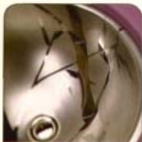
Elkay This company enlivens its stainless steel sinks by offering 12 patterns on several of its classic shapes (shown, Bamboo on the Azona 16" d sink, $600 to $950; ElkayUSA.com).