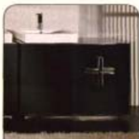
LaCava Introduce shimmer to the bath with the Martini cabinet, which has a low-VOC, rich black lacquer finish and is adorned with gleaming cross handle pulls ($5,880; LaCava.com ).