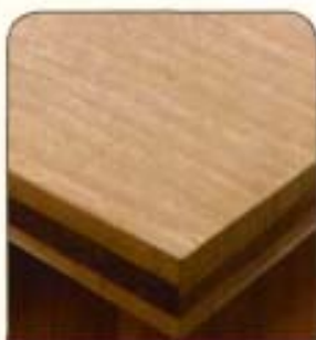
Teragren Its bamboo countertops provide a bacteria-resistant, formaldehyde-free surface pretreated with a food-safe mineral oil/beeswax finish ($26 to $32/sq. ft.; Teragren.com).

Green Team Green design continues to gain ground. For kitchens, sustainable bamboo is a top choice for cabinets and surfaces. And post-consumer, recycled materials score big in sleek countertops with improved strength. Also on offer, sustainably harvested woods and low-VOC finishes and adhesives. In bathrooms, low-flow faucets and toilets look to improve water savings.