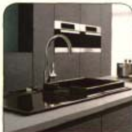
Duravit The Starck K ceramic kitchen sink by Philippe Starck has a large draining area, with room for everything from trays to cutting boards (35½" x 20½", $1,785; Duravit.us ).