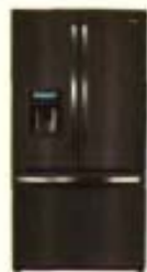
Kenmore The Elite Black Stainless Trio refrigerator's ebony finish complements stainless steel appliances—plus it hides grimy fingerprints ($3,300; Kenmore.com/blackstainless ).