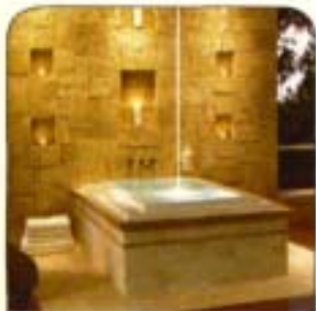
Eldorado Stone Comprised of a set of easy-to-install stone veneers, the CandleWall creates a blissful bathing atmosphere ($30 to $50/sq. ft. installed; EldoradoStone.com).