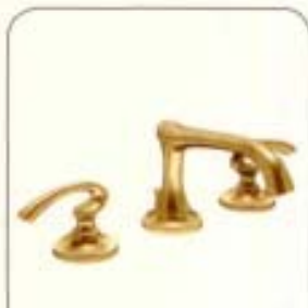
Symmons The Bolina 8-inch spread lav faucet has a velvety brushed-bronze finish and elegantly curving handles and spout, adding a grace note to the bath ($575; Symmons.com).