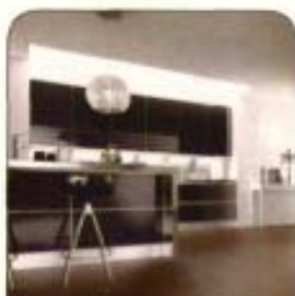
Scavolini The Italian company's black glass Scenery kitchen melds style and ecological awareness with a body of FSC-certified postconsumer wood (price on request; Scavolini.com ).