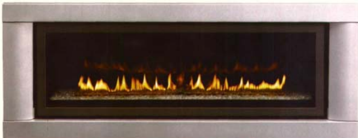
Napoleon Add romance to the bath—or any room in the house—with the 50-inch (HD50 Linear High Definition) gas fireplace. It has a heat-radiating glass enclosure and a crystalline ember bed that glows even when the flame is turned off (approx. $5,000; NapoleonFireplaces.com).

Modern Luxuries New opulent patterns, warm gold and bronze finishes, rich materials and appealing curves can turn the bathroom and the kitchen into places for self-expression and a bit of indulgence. Sculptural faucets and fixtures, like jewelry for the room, lend artistic flair. Surfaces gleam and lighting plays a key role, with the warmth of natural flames setting a seductive and relaxing mood.