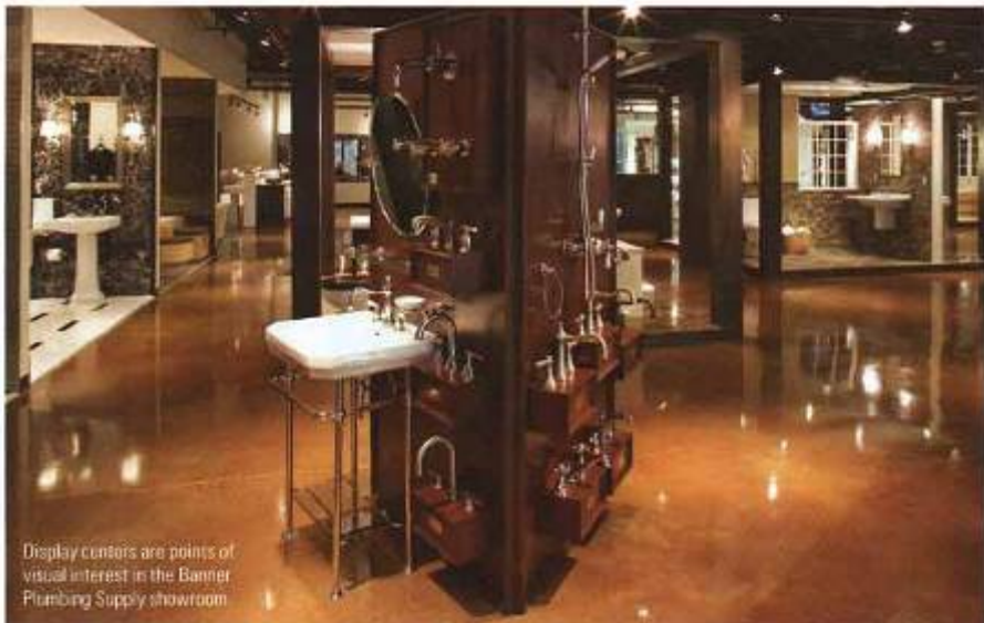
Display centers are points of visual interest in the Banner Plumbing Supply showroom.

The other half, she says, comes when the client steps through the door to tour Banner's