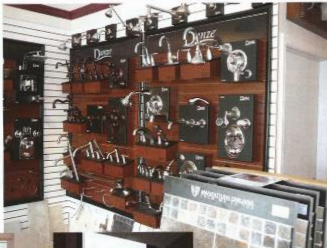
Above: Product selection in the R&R Tile and Bath showroom is focused for the market it serves.

"Many of our customers come to us after having had a negative experience at a box store," he says, noting that the price of more personalized