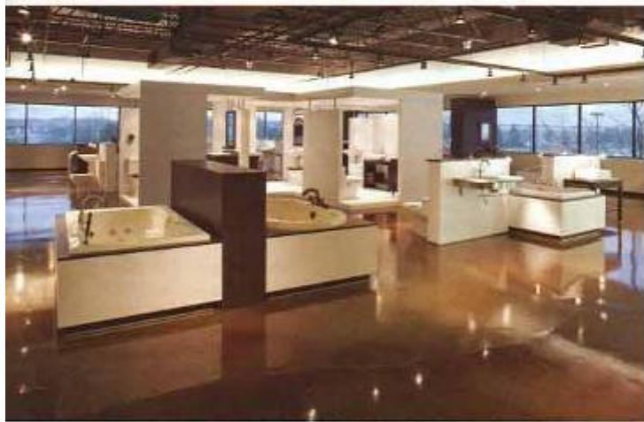
Right: Each vignette in the Banner Plumbing Supply showroom shows a wide array of product, resisting manufacturer-supplied displays and other visual branding.

"We've dropped certain manufacturers not because their lines weren't appealing, but because their price points eventually just weren't realistic for our market," he says.