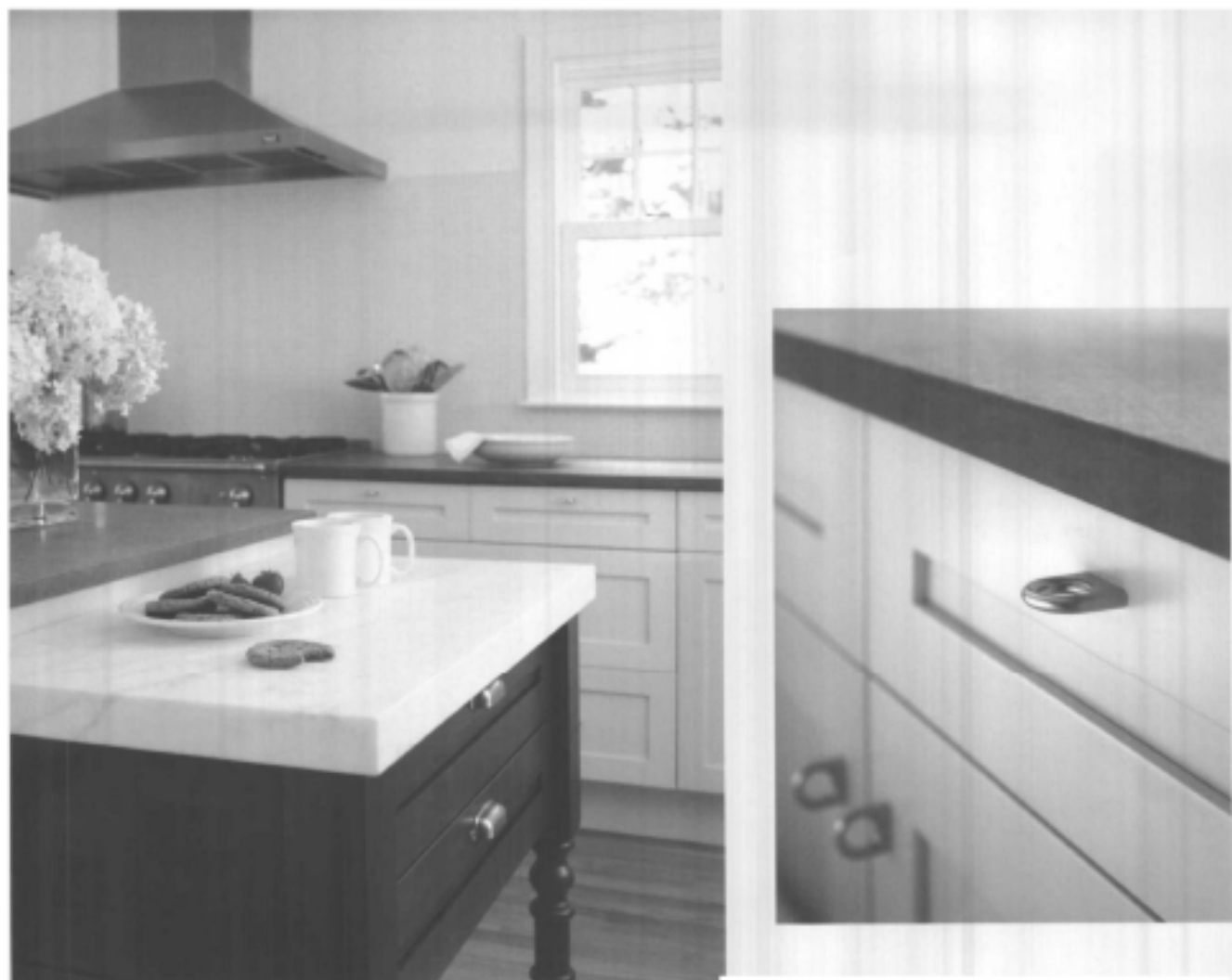
clockwise from above: The marble-topped baking station was custom-built to look like a piece of furniture; loop-like pulls are brushed nickel; GE refrigerator drawers were installed to keep drinks cool.